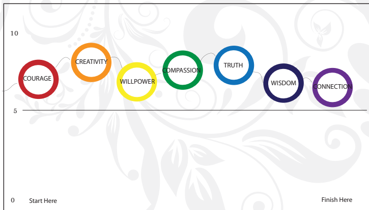
Life Area Strengths Indicator

An assessment of your strengths and potential. This view shows where you believe you are or how you put yourself out in the world. This may or may not be in alignment with the real you.